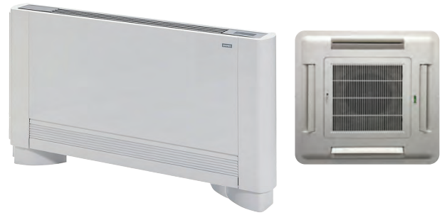
Wall and ceiling heating and cooling units