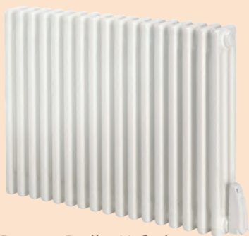
Purmo Delta H Column