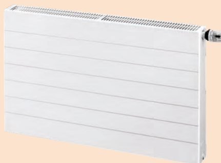
Purmo Ramo Ventil