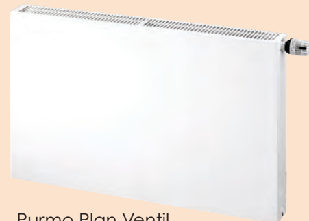
Purmo Plan Ventil